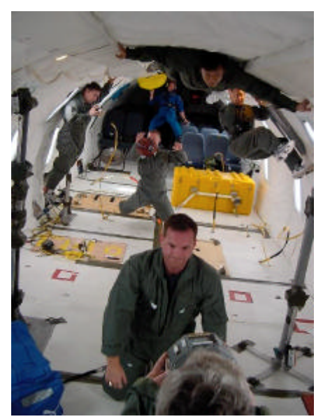
Figure 4. SPHERES KC-135 Operations