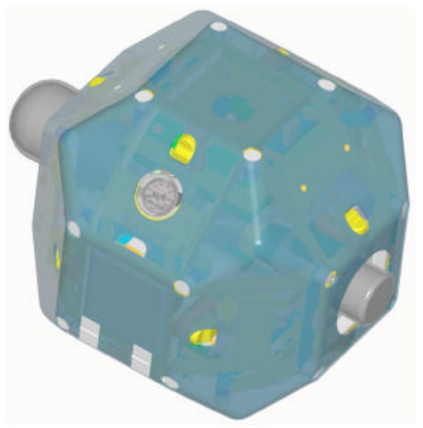
Figure 1. SPHERES flight unit

The SPHERES laboratory has been manifested in flight 12A.1 scheduled for launch on July 1<sup>st</sup>, 2003 (subject to NASA launch schedule); it will remain in orbit for a minimum of six months of operations aboard the ISS. Figure 1 shows a schematic of the flight units.